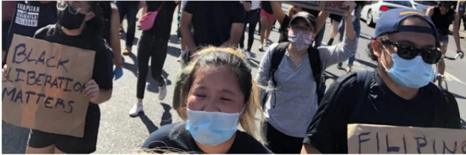
FILIPINOS MARCHING FOR JUSTICE IN JACKSON HEIGHTS, QUEENS NYC ON MAY 30.